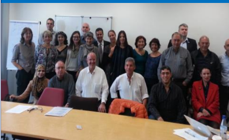
IRIS Partners in the 2 nd consortium Meeting

We are now completing WP2: strategic plans, and starting WP3: internationalization programs and WP4: training activities for IRO professionals.