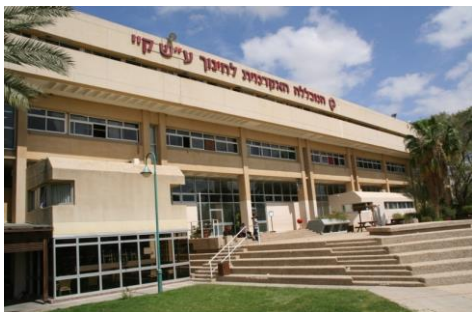
Kaye Academic College of Education, Beer Sheva, Israel.

Kaye College is today the leading academic institution for teacher education and professional development of educators in the south, serving both the Jewish and Bedouin populations of the Negev.